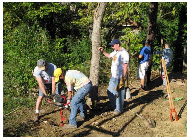
Above: Volunteers from the Newman Center and other Catholic churches in Lexington build a fence at a Habitat for Humanity house.