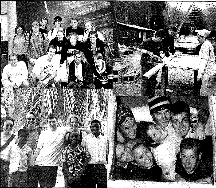
Clockwise from top left: Mission trip to New Mexico; Building Habitat house in Appalachia; ?????????? ?????? ??????; Students serving at St. Vincent Strombi in Jamaica