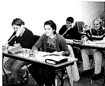
Your support of the annual student phoneathon aids in many student activities including spring break service trips.

The second big activity of the semester was Spring Break. Around thirty students joined the alternative Spring Break mission trips to New Mexico, Appalachia, and Jamaica. After much fundraising and with the support of the Newman Foundation we were able to offer the trips at a reduced price so that the trips were an option for all students. I was lucky enough to go to Jamaica and experience the culture of another country. After a three-hour van ride I and the four other members of our group arrived at St. Vincent Strambi High School in Bull Savannah, Jamaica. During our one-week stay we were able to visit a nearby orphanage, help students in the high school write pen pal letters to American students, and most importantly, reorganize the school library. We all came away with something different, but I think one thing we all agreed on was that we were very lucky. We all began to gain a greater appreciation for our education, fresh water, food, and our families. We went there to be of service to the people we met, but in the end I believe we came away with more than we gave.