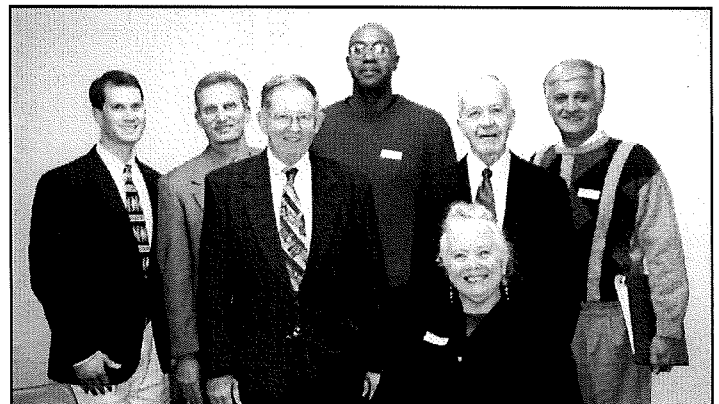
2002 Board Members