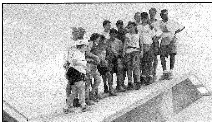
Below: UK students in Homestead, FL. during 1994 Habitat for Humanity Collegiate Challenge.