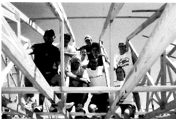
Habitat for Humanity work crew, Miami, FL

Please clip and mail to Newman Foundation Inc. 320 Rose Lane, Lexington, KY 40508-3306